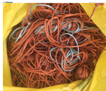
Clean twine in a collection bag.