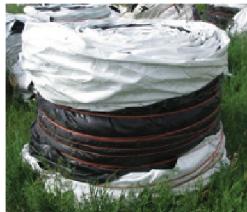
Tightly rolled grain bags.

Thank you for helping Alberta build an agricultural plastics recycling program that helps keep our agricultural community clean and environmentally friendly.