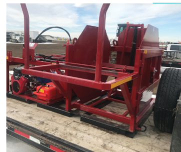
The MD of Taber's grain bag roller.